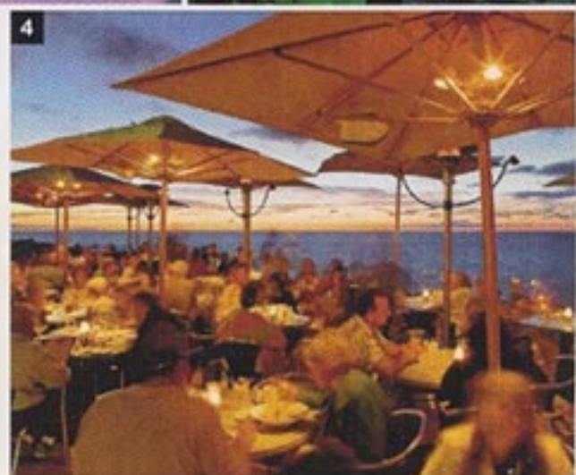
1. La Jolla Cove. 2. Catching a wave at Surf Diva camp. 3. The Birch Aquarium. 4. Sunset at George's at the Cove.